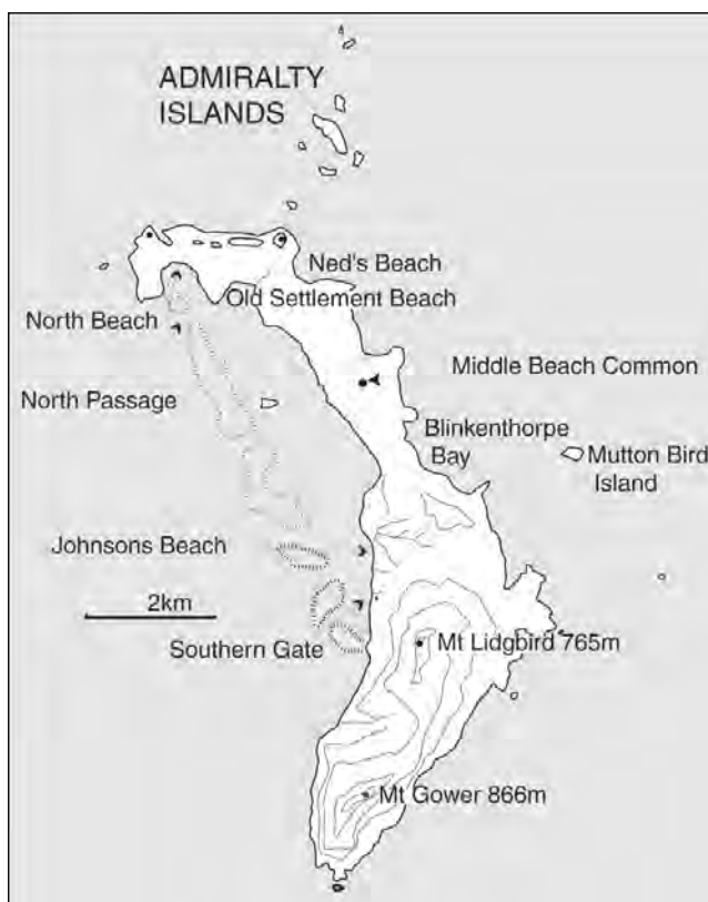
Figure 1 Lord Howe Island showing places mentioned in the text.