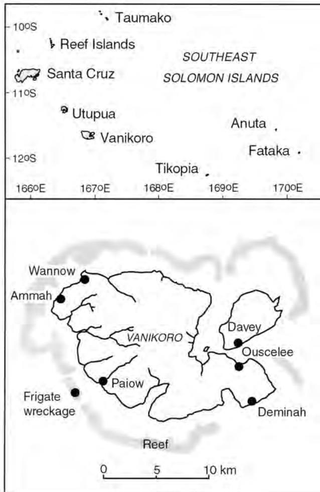
Figure 1 The southeast Solomon Islands and Vanikoro showing the location and name of settlements visited by Peter Dillon.

identify the distribution and abundance of La Pérouse objects within Vanikoro and on the neighboring islands of Tikopia, Utupua and Santa Cruz (Ndeni), representing the transfer of European artefacts over a linear distance of 370 km. Textual records are then examined to identify factors that appear to have affected proto-historic interaction patterns and which may have implications for Oceania’s archaeological records of contact.